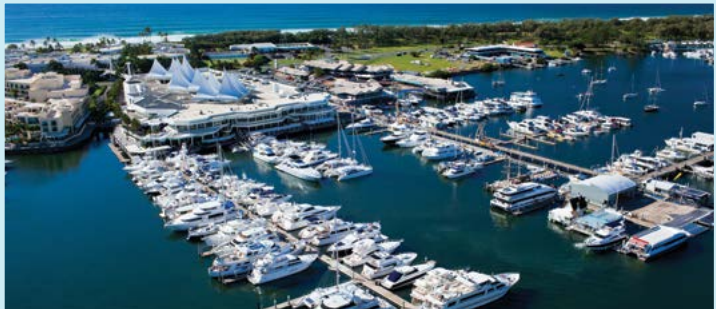
Admire multi-million dollar yachts at Marina Mirage