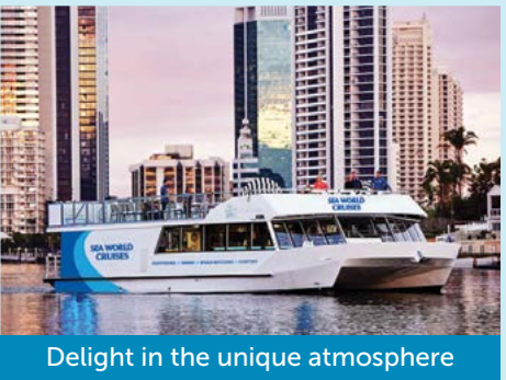
Delight in the unique atmosphere