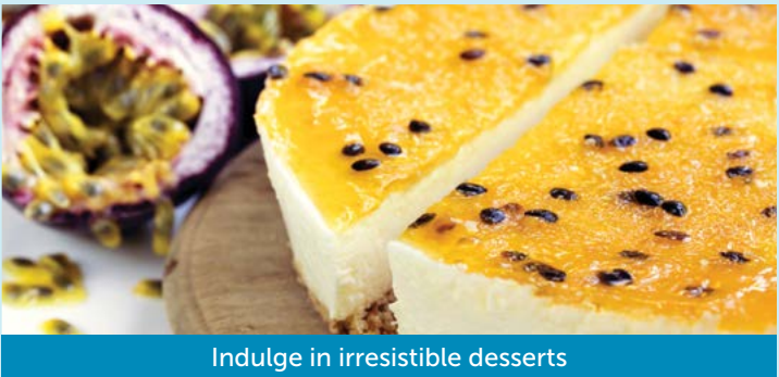
Indulge in irresistible desserts