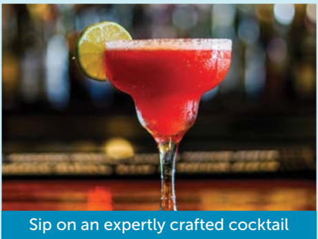
Sip on an expertly crafted cocktail