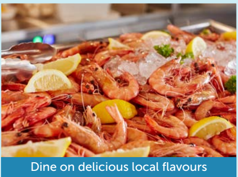
Dine on delicious local flavours