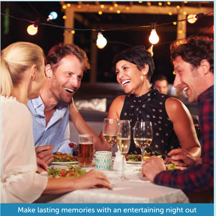
Make lasting memories with an entertaining night out