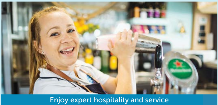
Enjoy expert hospitality and service