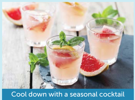
Cool down with a seasonal cocktail