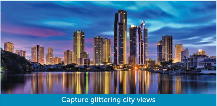
Capture glittering city views