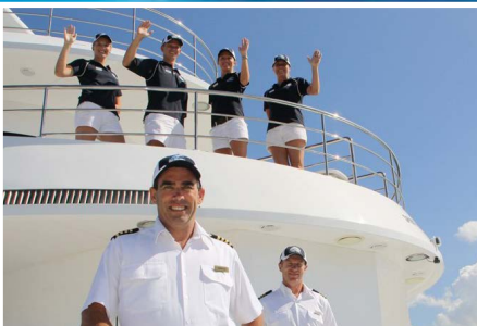
Learn from our experienced captains and marine naturalist guides