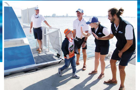
Share in the excitement of an ocean adventure with the whole family