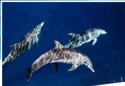
Look for three species of dolphins, sea turtles, sea birds and more